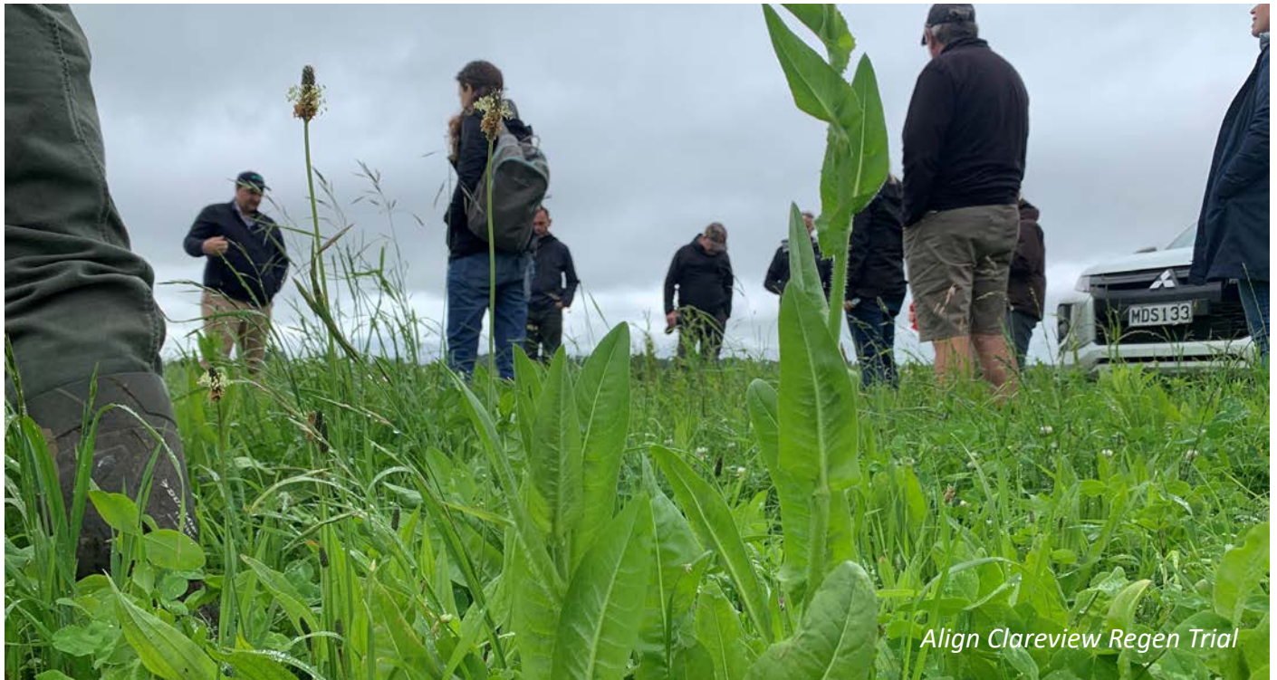
Align Clareview Regen Trial

The trip was an opportunity to showcase the great work MHV farmers are doing and bring people together to find common ground for a shared vision to drive improved water quality outcomes.