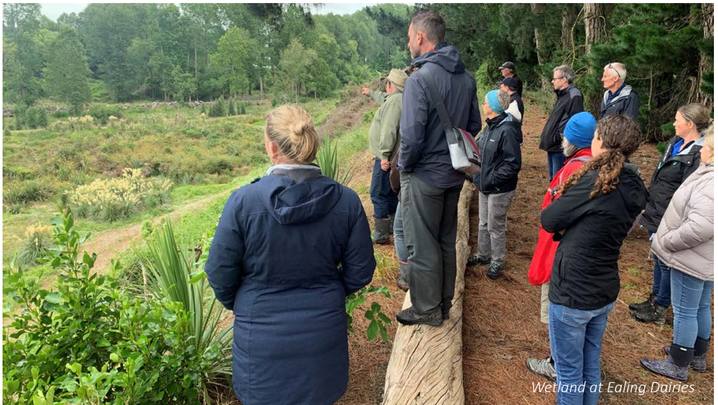
Wetland at Ealing Dairies