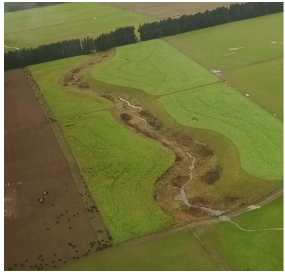
Examples of vegetated buffers.