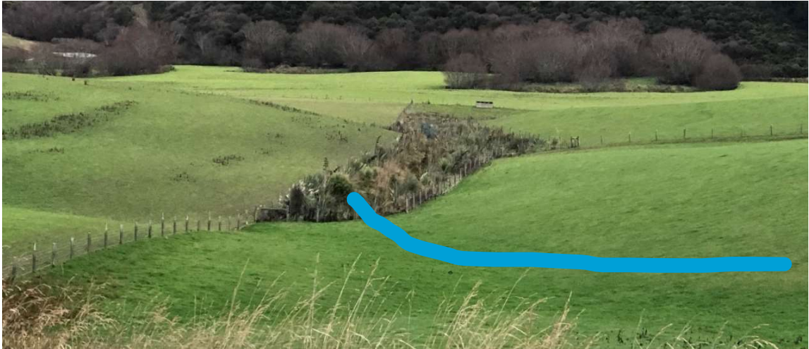
Critical Source Area shown in blue above. More examples below.

No, you need to keep stock out of the whole Critical Source Area from 1 May to 30 September each year unless you have resource consent. It is good practice to put in place measures to trap sediment at the bottom of these Critical Source Areas, for example hay bales or sediment traps.