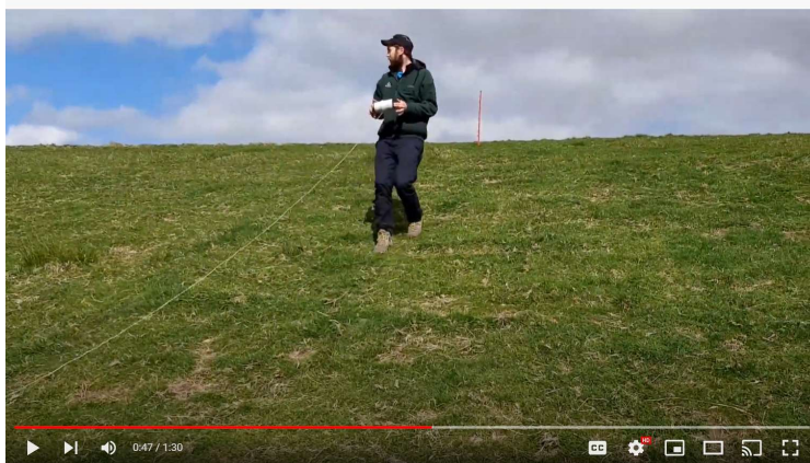
Tips on how to measure the slope of your paddocks

The video below explains how to measure slope in your winter grazing paddocks.